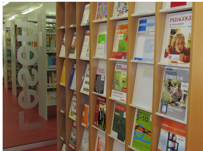
Current journals can be found in the reading room005160005300510245

As a central establishment we mainly provide members of the University of Education Karlsruhe with literature to support their studies, teaching and research. However, anyone with scientific and professional interests is welcome to use our services.