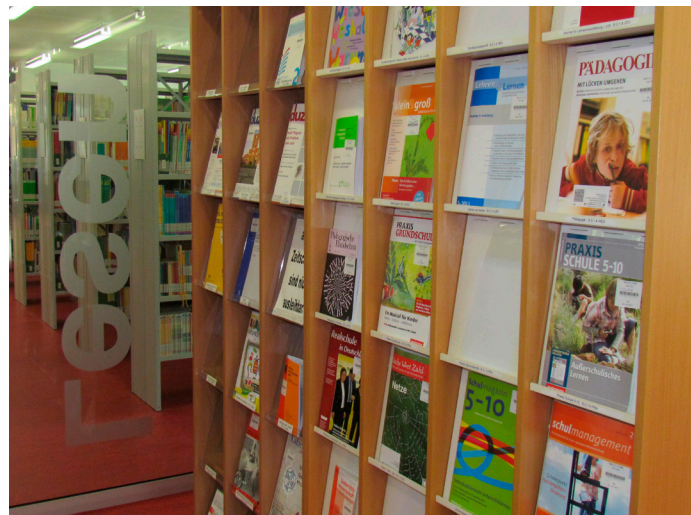
Current journals can be found in the reading room

As a central establishment we mainly provide members of the University of Education Karlsruhe with literature to support their studies, teaching and research. However, anyone with scientific and professional interests is welcome to use our services.