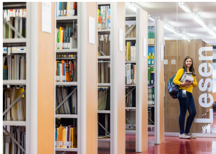
The university library offers a wide range of literature

As a central establishment we mainly provide members of the Karlsruhe University of Education with literature to support their studies, teaching and research. However, anyone with scientific and professional interests is welcome to use our services.